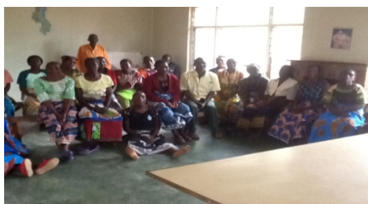
HIV support group