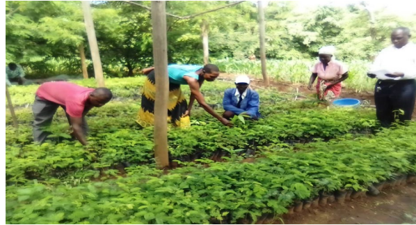
The Tree Nursery