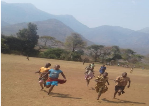
The Likulezi Olympics