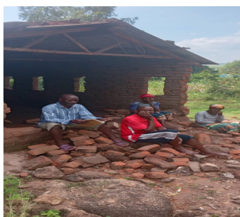
After the flood