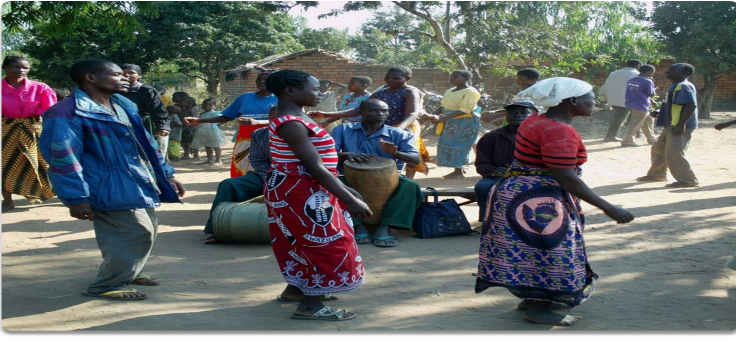
Drama group at awareness campaign