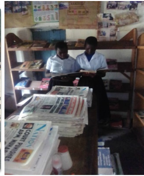
schoolgirls in the Library