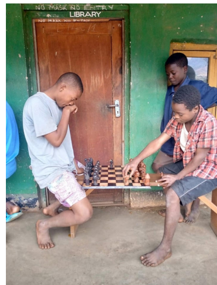
Practising for chess competition