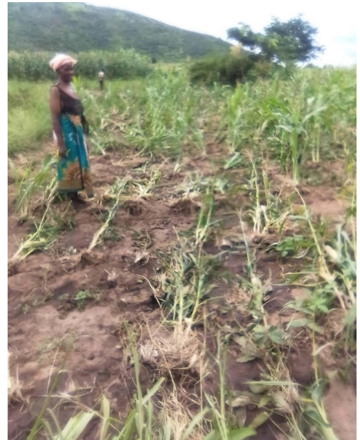
Lady's destroyed crops after the floods