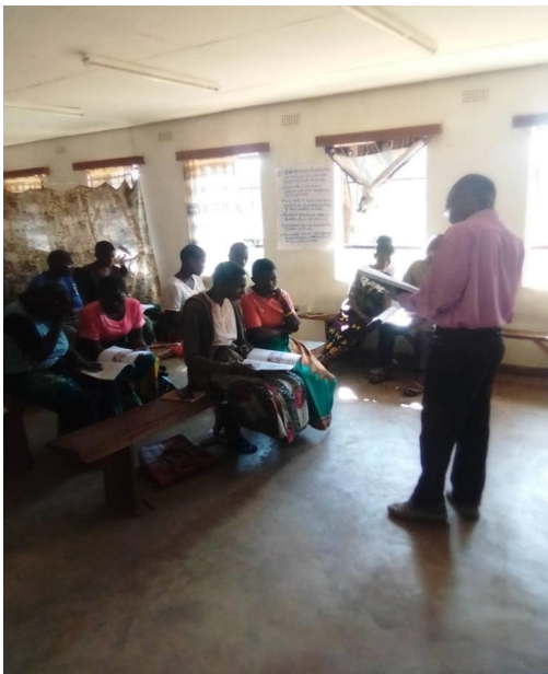
Volunteers learning how to teach