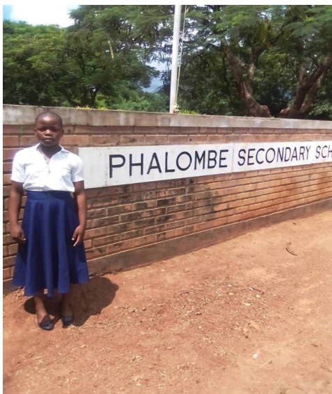
"Gladus" made it to secondary school