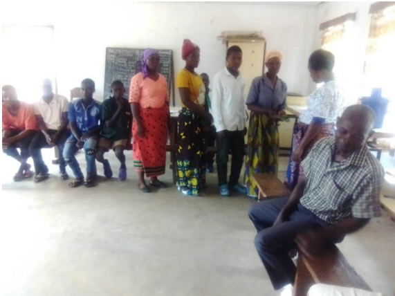
Children are collecting their fees