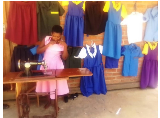
Orphan as a tailor making uniforms